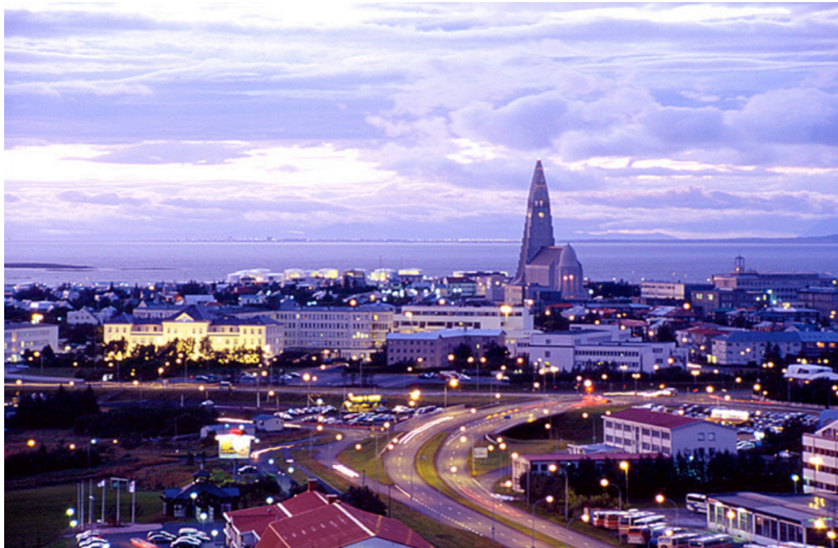
Reikjavik at midnight in July..